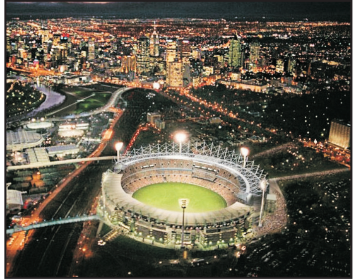
With 25km's of nosing and more the 5,000 aisle markers Melbournes iconic MCG is Ecoglo's largest installation to date.